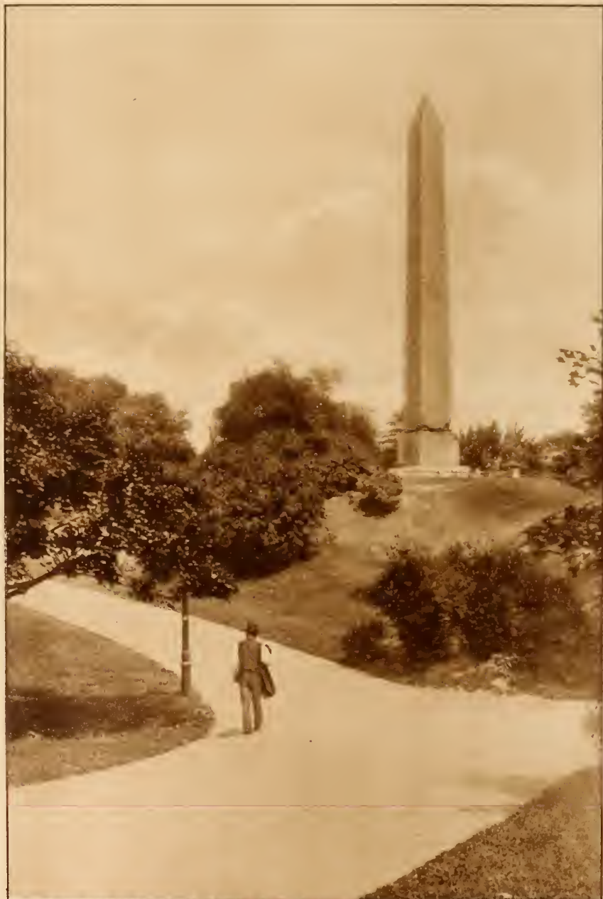
OBELISK IN CENTRAL PARK. It was known as Cleopatra's needle. Originally erected in Egypt in 1600 B. C. and carried to New York under great difficulties.